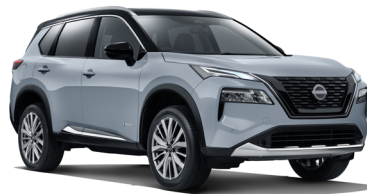
Ceramic Grey with black roof # ~