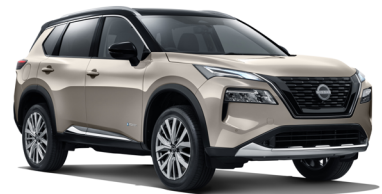
Champagne Silver with black roof # ~