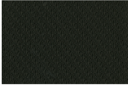
Black synthetic leather seat trim. Available on ST-L.