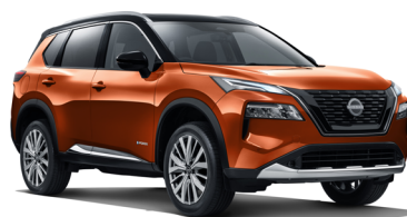
Sunset Orange with black roof # ~