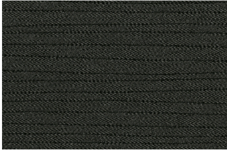
Black cloth seat trim. Available on ST.