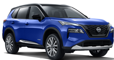
Caspian Blue with black roof # ~