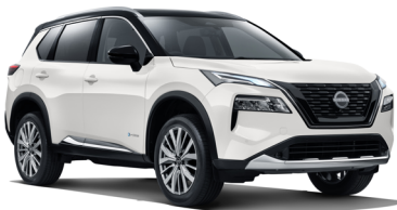
Ivory Pearl with black roof # ~